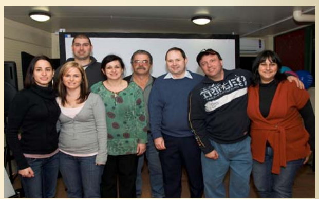
OUR WONDERFUL COMMITTEE