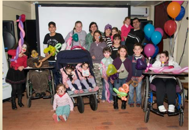
THE BEAUTIFUL CHILDREN