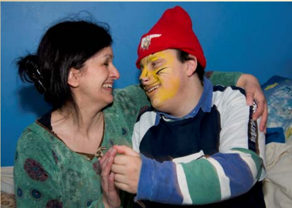
LOVING MOTHER AND SON