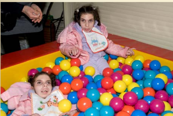
THE TWINS HAVING FUN