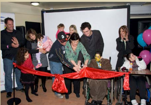
THE OFFICAL OPENING